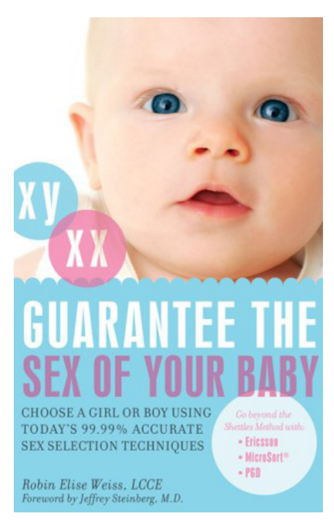
One of several recently-published books capitalizing on consumer interest in sex selection.

constitutional. Recent Supreme Court cases have held that the state may place limits on a woman's right to obtain abortions as long as they are not overly burdensome. Narrowly defined limits, such as 24-hour waiting periods and mandatory sonograms, have passed constitutional muster. The Supreme Court could find that sex selection perpetuates—or is equivalent to—discrimination against women, and that preventing discrimination against women is a legitimate state interest that overrides the right to obtain an abortion.