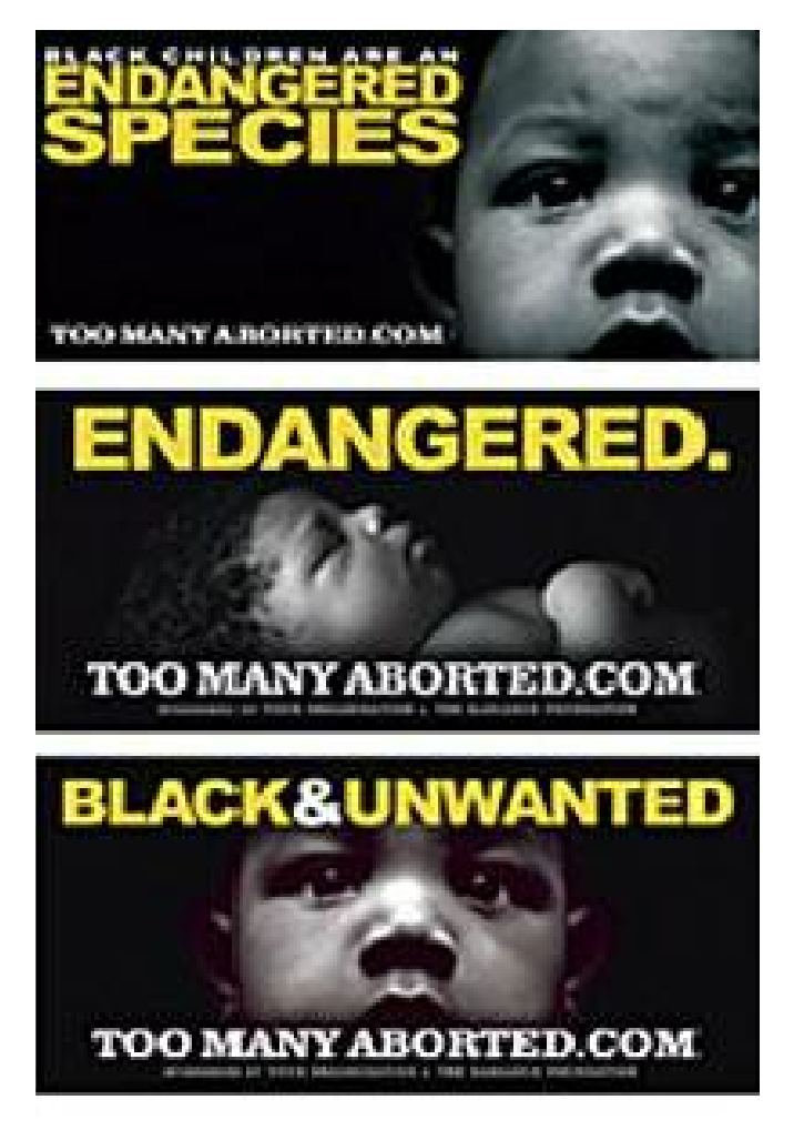
media and calling campaign, made sure these billboards came down.

Anti-choice forces clearly believe that both the legislation on race, abortion and sex selection and the billboard campaign on race, abortion and genocide are extremely useful components of their current message and strategic plan. Conservative legislators and activists alike are using this issue to advance their pitch that restricting or banning abortion protects women. They also seek to divide social justice groups while appropriating the language of racial justice, women's rights, and human rights in order to strengthen their moral